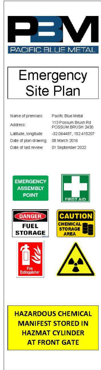
Figure 2: Emergency Site Plan