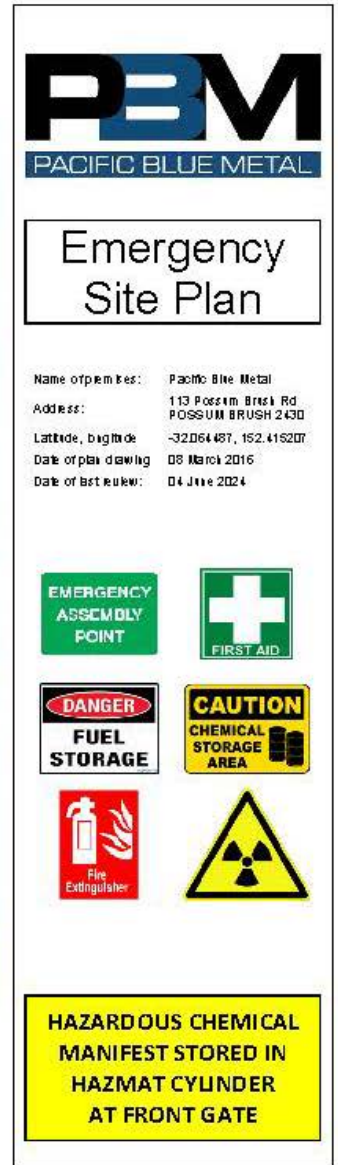
Figure 2: Emergency Site Plan