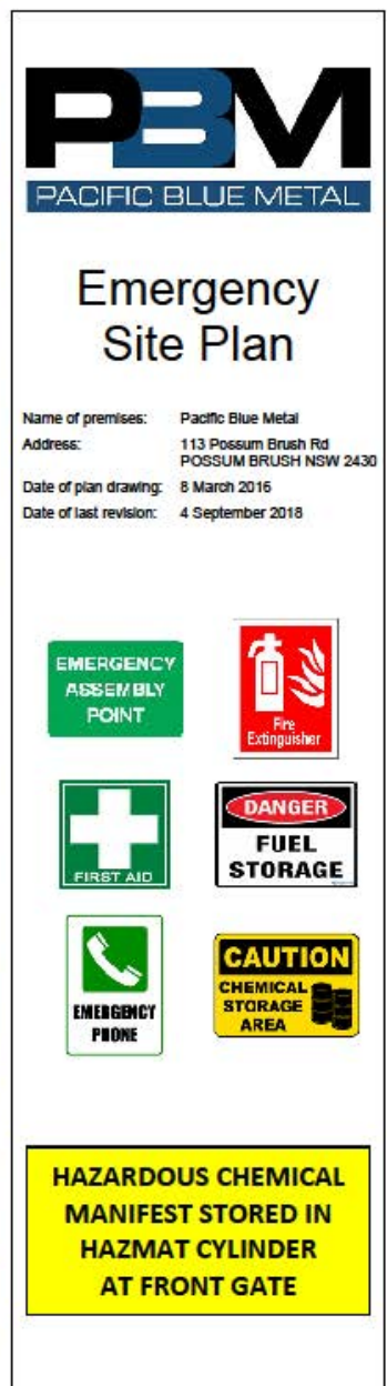
Figure 2: Emergency Site Plan